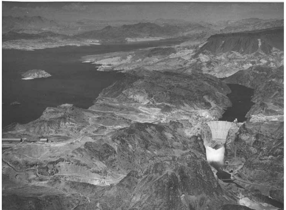
1936 aerial photo of Lake Mead filling behind Hoover Dam. The white spray in front of the dam is from the open water outlets.

Lake Mead, part of the Colorado River System, is the largest reservoir in the United States and the sole source of drinking water for 1.6 million Southern Nevada residents. More than 20 million downstream users draw their drinking water from Lake Mead. Lakes Mead and Mohave are managed by the National Park Service as a National Recreation Area (NRA). Southern Nevada's increasing urbanization raises concerns over potential impacts to the existing high water quality of the lakes, and to the terrestrial wildlife,