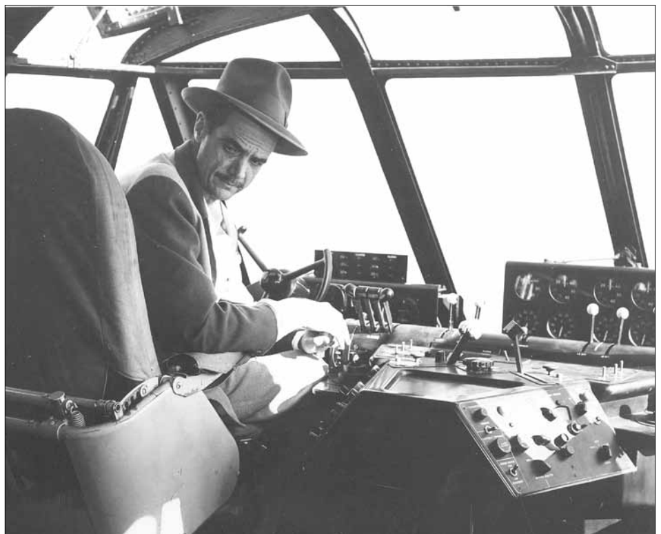
Howard Hughes at Flying Boat controls. “Welcome Home, Howard!” collection

More information about the Libraries’ digital collections, dmBridge, and dmMonocle can be found at http://digital.library.unlv.edu/ , http://digital.library.unlv.edu/dmbridge/ , and http://digital.library.unlv.edu/dmmonocle/ .